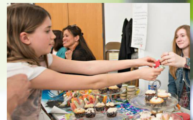
Working together to help those in need