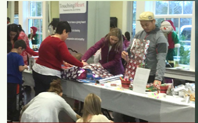
Presents for foster care kids