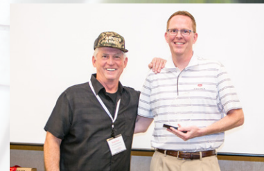
Advisory Boards in action