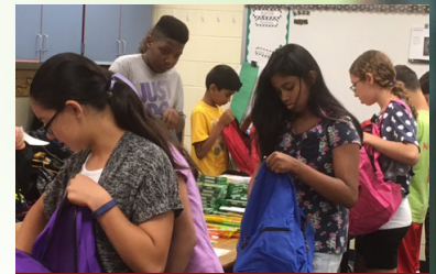
Stuffing backpacks for kids in need