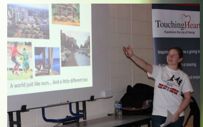
Developing leadership skills