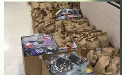
Bagged lunches for homeless shelters