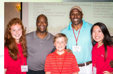
Redskins Legends Darrell Green and Ken Harvey

Thank you for your support! Your sponsorship does so much - first, it funds our Kids on a Mission and Schools on a Mission programs that help children learn about the joy of giving back. Second, your donation multiplies in value as these children complete service projects and raise funds to provide basic necessities for children in local foster care, in local homeless shelters, and in carefully screened orphanages worldwide.